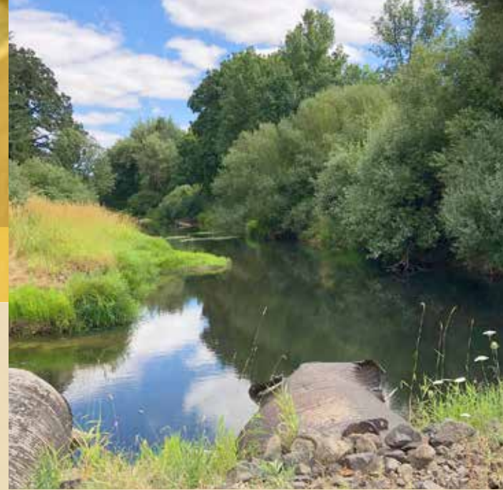
Roughly 400 mounds are thought to be within the Calapooia River watershed, though only 22 sites have been formally recorded.