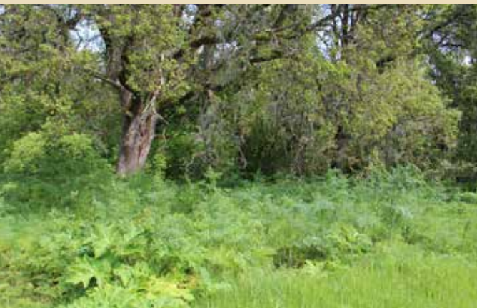
Dense vegetation can make identifying sites difficult. Can you see the mound in this photo?

More importantly, this research demonstrates the possibilities that occur when universities, tribes, and the community collaborate to learn more about the past.